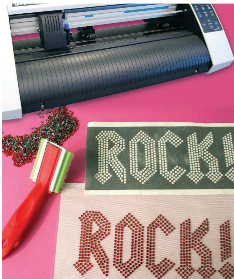
COLMAN & CO.; CIRCLE 164 ON FREE INFO CARD

The new Brush N Bake from Colman and Co. offers embroiderers an easy way to start offering clients rhinestone designs – or add them to existing print or embroidered designs. The bundle comes with a 15" plotter/cutter, Sticky Flock rhinestone template material and enough Hotfix rhinestones and extra tools to get started. A real advantage of Brush n Bake, however, is the Hotfix Era software that comes with its purchase. Hotfix Era is part of Sierra's Design Era Suite, which means you can pull your embroidery designs in and add rhinestone embellishments in the same application.