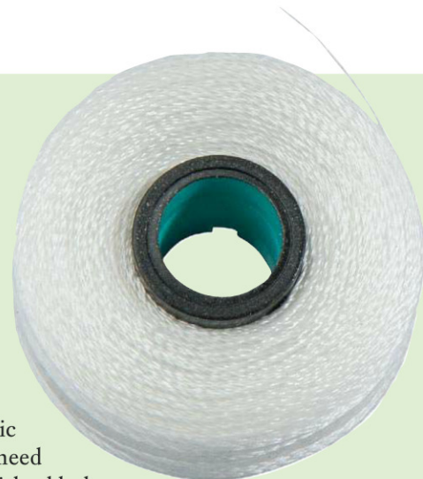
AMERICAN EMBROIDERY SUPPLY; CIRCLE 163 ON FREE INFO CARD

Improve your embroidery quality and increase your production by using new Magna-Glide magnetic bobbins (#P-15-IL) offered by American Embroidery Supply. The bobbin's magnetic core, combined with EB cross-link technology, optimizes thread delivery to create consistent tension from the beginning to end of each bobbin. It eliminates the need to re-set tensions as your bobbin thread runs out, and the magnetic core also prevents backlash or overspin, eliminating the need for anti-backlash springs. In fact, you should remove anti-backlash springs before you use Magna-Glide bobbins.